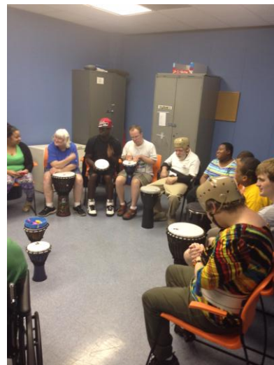
Participants in drumming class

Over the past year, we have had the opportunity to have a visual art residency, music residency, dance residency and a host of outside activities including taking participants to Theater in the Park and hosting the Triangle Youth Philharmonic site. The arts grant has provided training, allowing our staff to positively impact their job skills and the lives of our participants. WE had several guest speakers this year who shared exciting activity opportunities in the Wake County Catchment area. Additionally, we were honored to receive tickets to the Carolina Nutcracker which allowed six participants from a group home that we serve at our Raleigh site and two other participants along with staff to attend the show this year. The grant from the City of Raleigh Arts Commission was instrumental in making it possible to continue the ongoing process of ensuring that Wake Enterprises remains the leading day service program for adults with disabilities. The art instructors communicated valuable information that allowed all parties to see how they fit into the big picture, thus expanding their horizons. The residencies have been providing training to